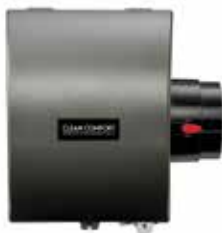
12 and 17 Gallon