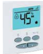
Digital Wall Humidistat