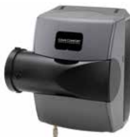
12 and 17 Gallon