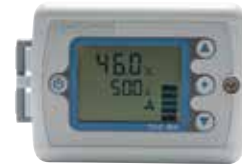
Digital Duct Humidistat