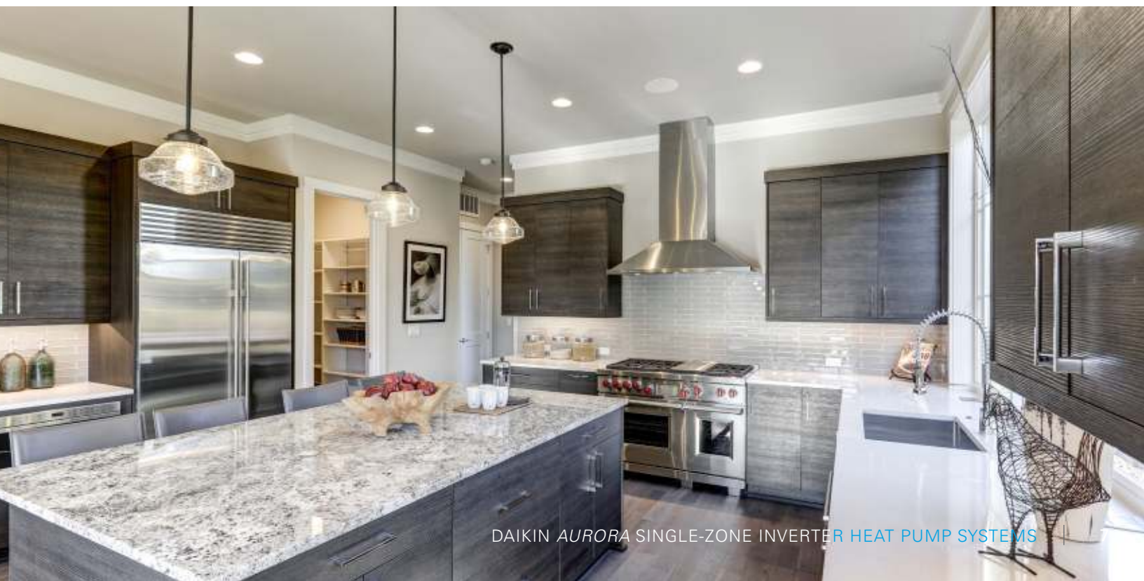
DAIKIN AURORA SINGLE-ZONE INVERTER HEAT PUMP SYSTEMS

Use of the AHRI Certified® mark indicates a manufacturer's participation in the certification program. For verification of certification for individual products, go to www.ahridirectory.org